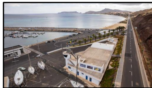
Image 1. Clube Naval do Porto Santo