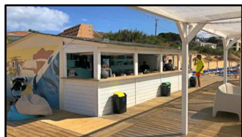
Image 2. Hotel Vila Baleira Porto Santo (Beach Bar, right picture)